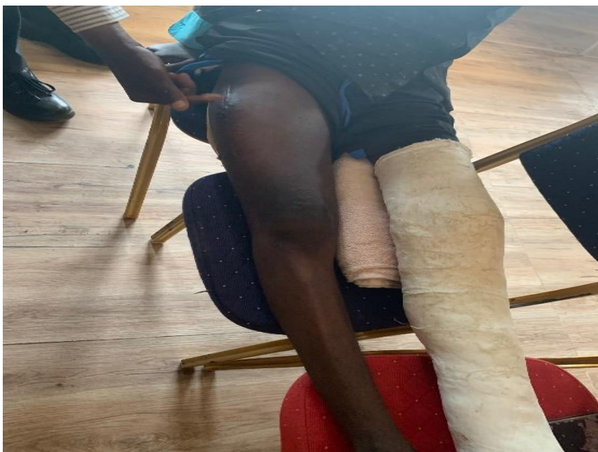
Plaintiff John Doe 5's crushed legs

expense their educations and futures; they are being regularly maimed and killed by tunnel collapses and other known hazards common to cobalt mining in the DRC. The following photo is of Plaintiff John Doe 5's crushed legs. He was mining cobalt in a tunnel with no supports for Congo Dongfang Mining, which is part of Huayou Cobalt, which sells cobalt to Defendants Apple and Microsoft. He is typical of the young men maimed by cobalt mining in the DRC, where production has soared under extremely primitive conditions to meet the demand for cobalt caused by the tech boom led by Defendants.