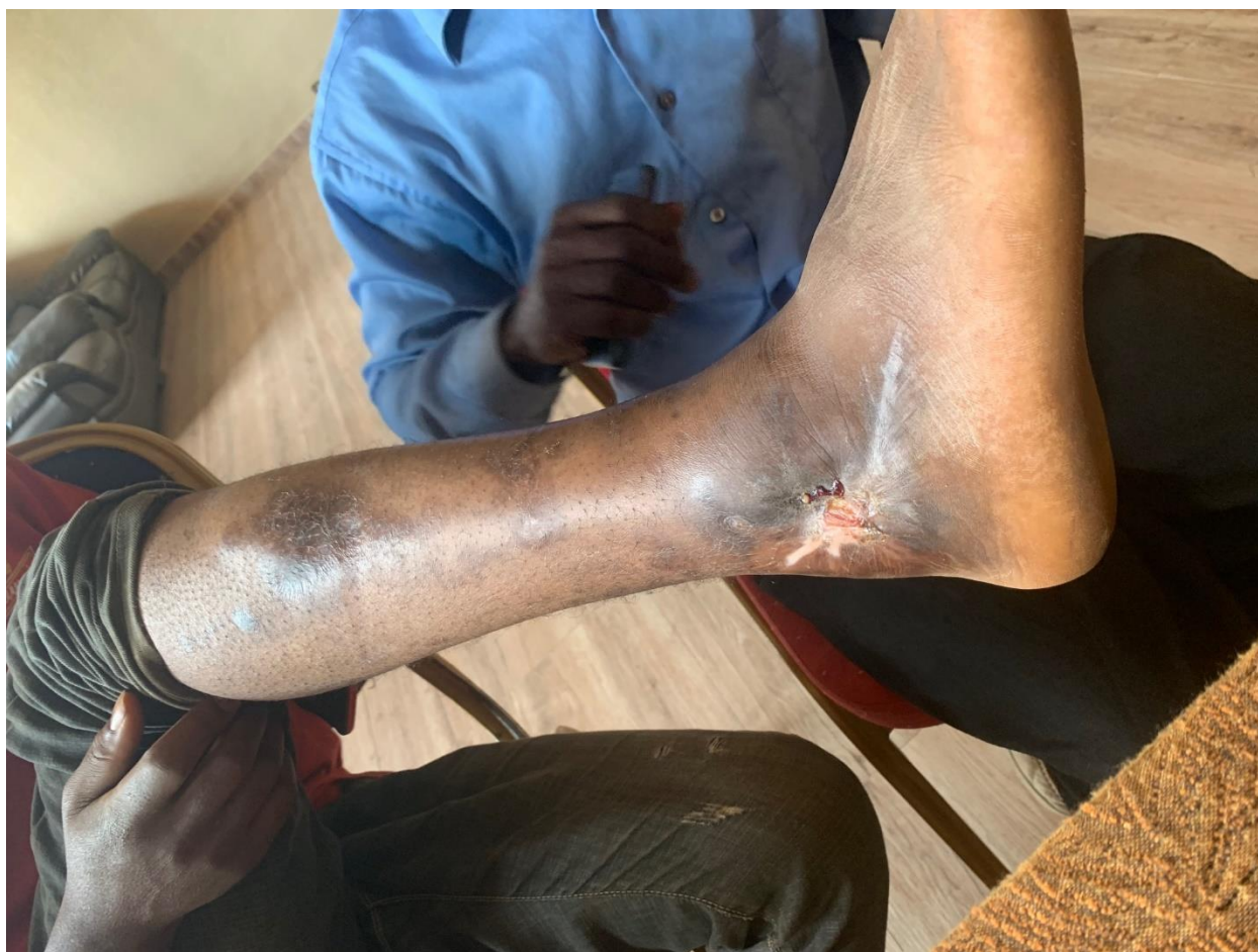
John Doe 4

same accident He was born February 8, 1994 and had been working at the mine since 2015. He leaves behind a wife and two children, one of whom was born after the accident. John Doe 4 was taken to a small clinic nearby. His left leg was severely smashed, and he now has a metal bar inside to hold the bone in place. He is in constant pain and can no longer use the injured leg. He is unable to work as a result of the injury.