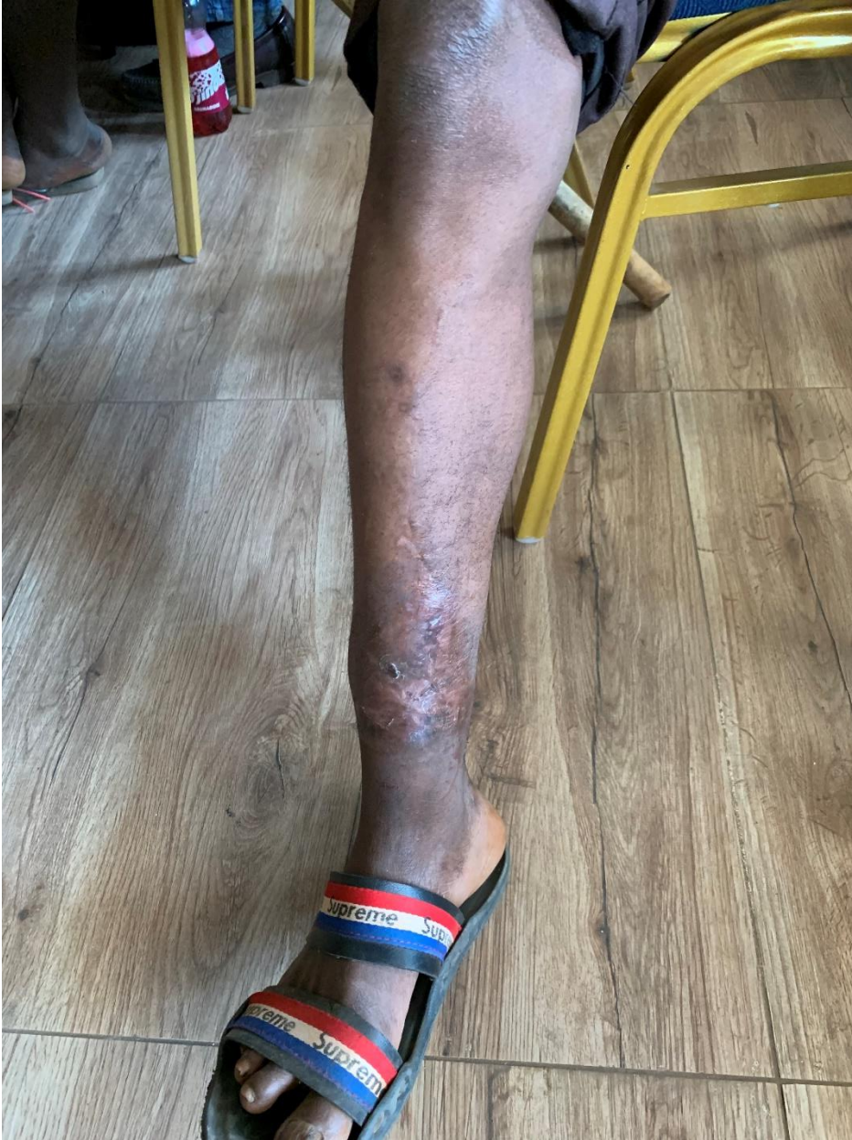
John Doe 9

36. Jenna Doe 10 brings this claim on behalf of her minor son, John Doe 10, who was born on September 18, 2002. John Doe 10 completed the ninth grade of school. When he was 14 years old, he started going to work in the mines after school was over at 1:30 pm each day. He worked at the Kamilombe No. 1 mine, which is